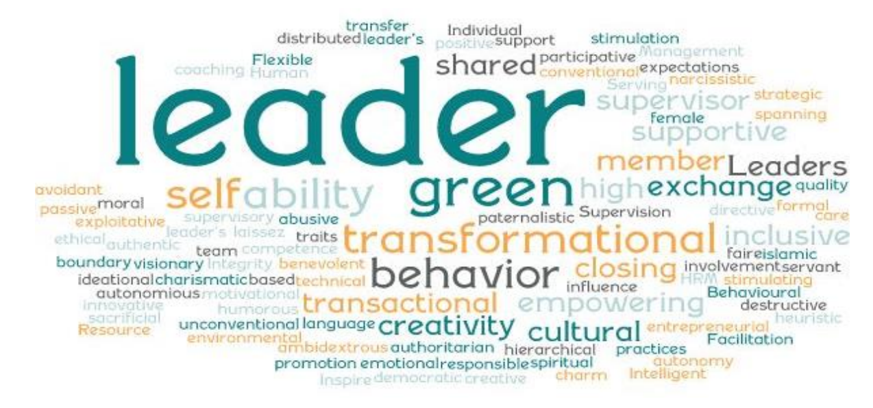
Figure 2: Leadership wise Publications on Innovation

The leadership roles identified were categorized into Transactional Leadership, Transformational Leadership, and a combination of both. The results presented the findings to address the research question regarding role of leadership in employees innovative work behavior. The key findings are as follows: