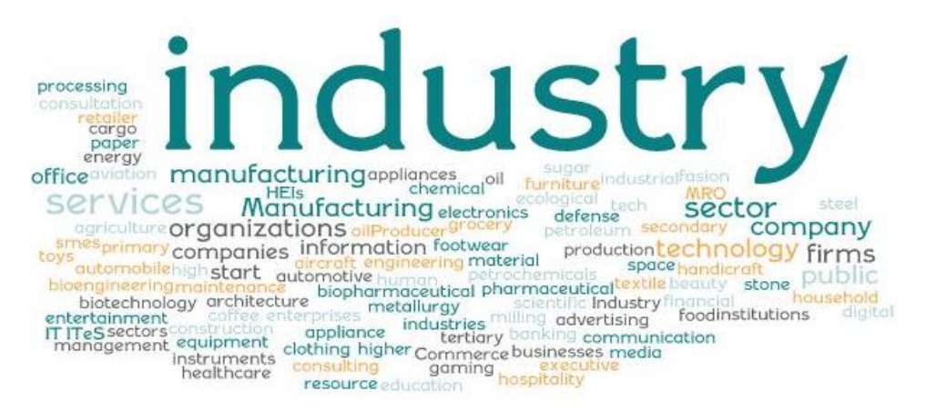
Figure 3: Industry Wise Publication on Leadership Contribution to Innovation

The industry wise analysis of 608 studies included for overview of leadership contribution in employee innovation. The results presented the findings to address the research question regarding contribution of transformational, transactional and hybrid leadership to employees' IWB and in primary, secondary, and tertiary industries. The key findings are as follows: