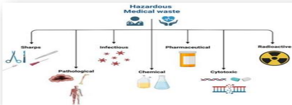
Figure 1: HMW Types