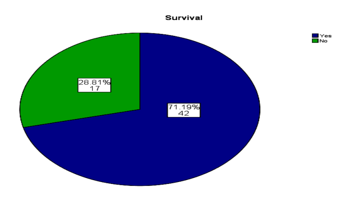
FIGURE 1: Pie Chart Showing Overall Survival Rate